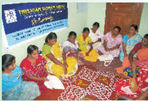
Republic Day celebration