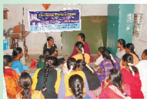
Thiyagam Annual Day celebration