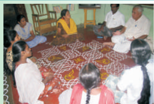
Values in life - A sharing & discussion