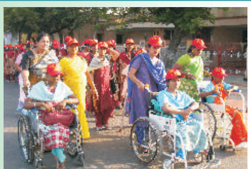
Madurai Marathon 2009