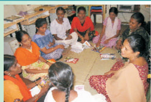
Reading and Sharing programme