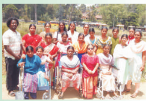
Refresher Tour Kodaikanal